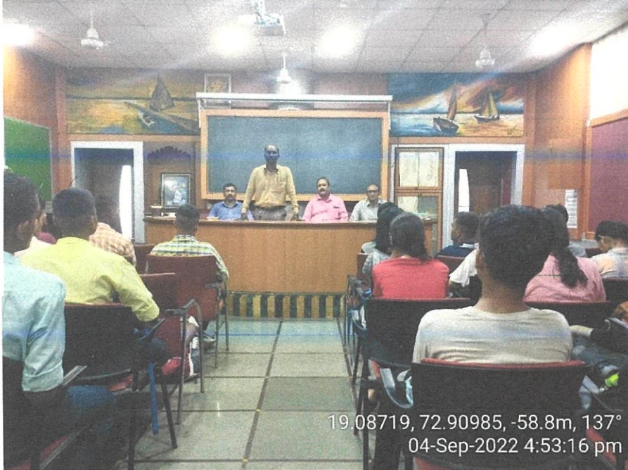
19.08719, 72.90985, -58.8m, 137° 04-Sep-2022 4:53:16 pm