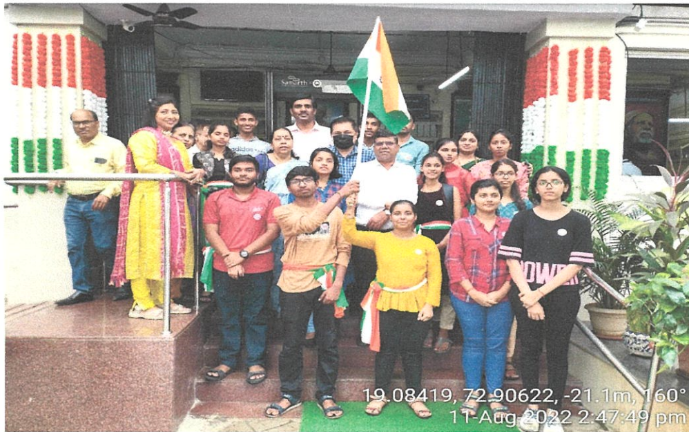
Students holding Tri colour at N Ward

PRINCIPAL RAMNIRANJAN JHUNJHUNWALA COLLEGE OF ARTS, SCIENCE & COMMERCE (AUTONOMOUS) Ghatkopar (W), Mumbai-400086, Maharashtra, INDIA