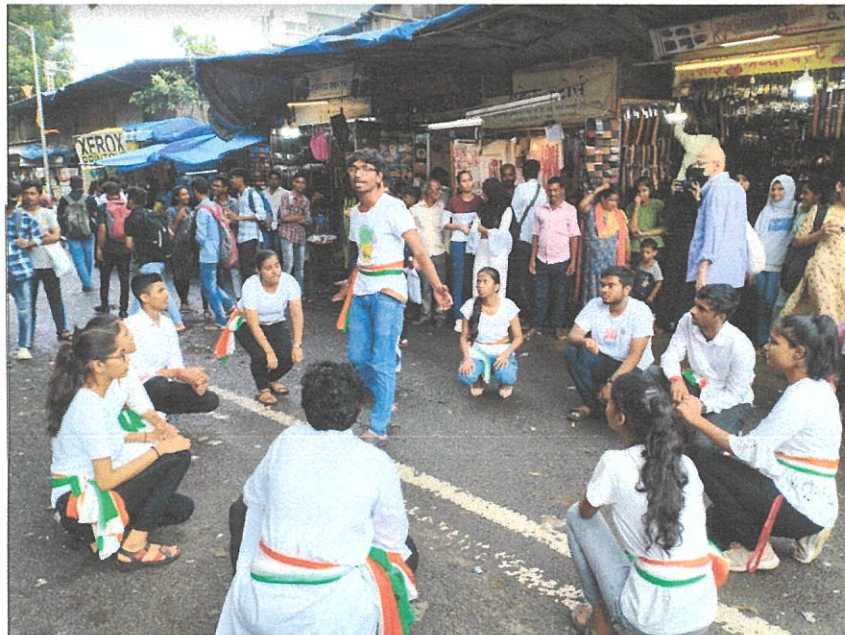
Students while performing the street play