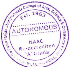
PRINCIPAL RAMNIRANJAN JHUNJHUNWALA COLLEGE OF ARTS, SCIENCE & COMMERCE (AUTONOMOUS) Ghatkopar (W), Mumbai-400 086, Maharashtra, INDIA