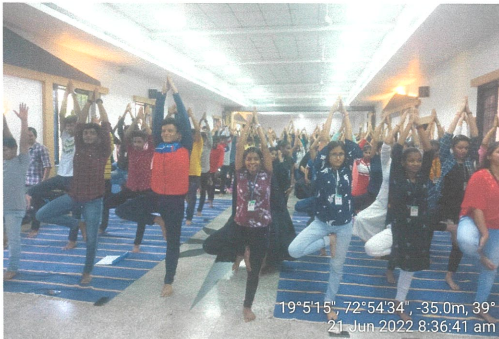
Students during the yoga session