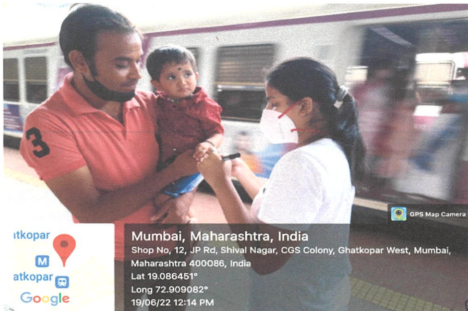
NSS Volunteers administering pulse polio dose