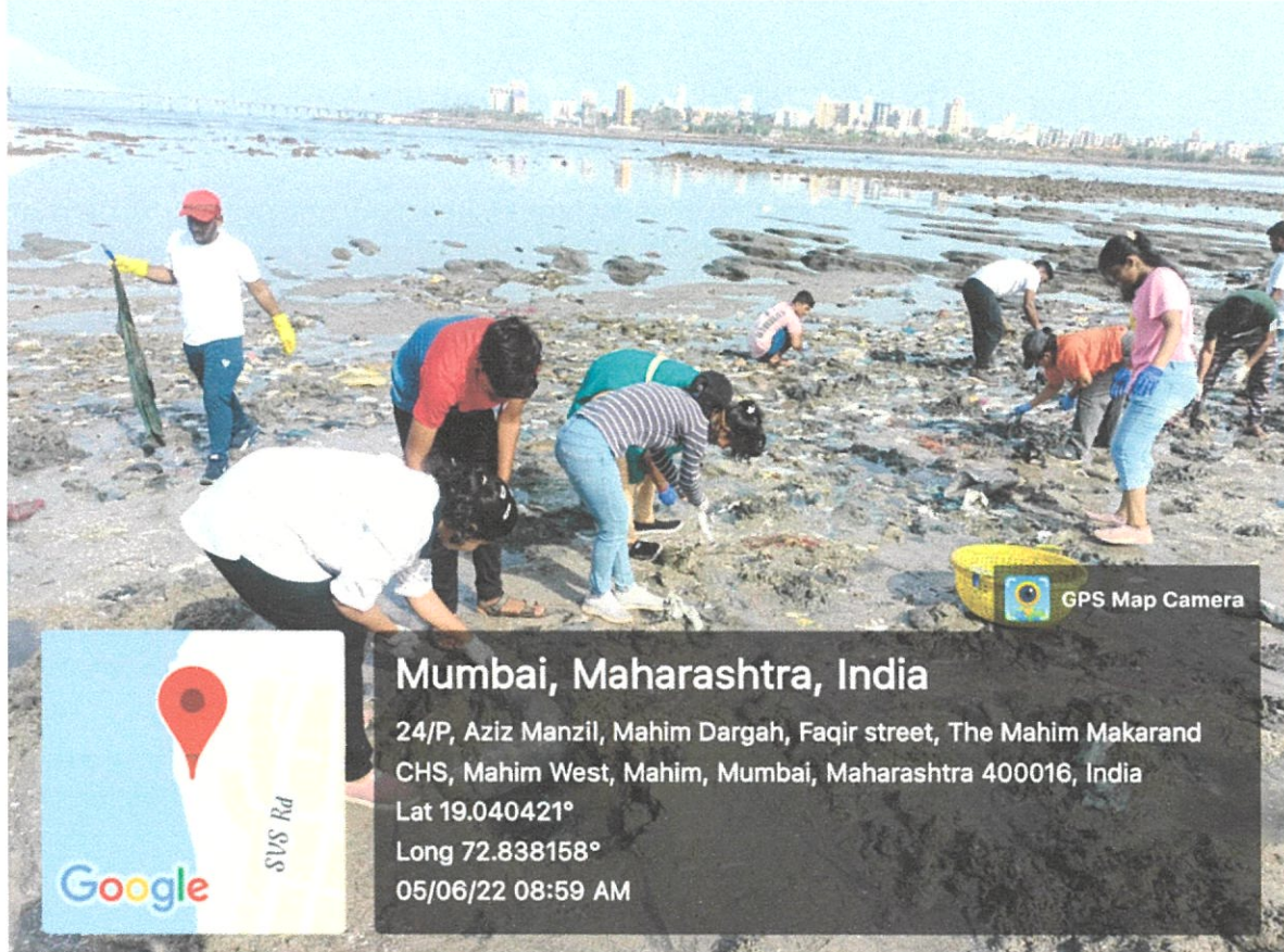
NSS Volunteers during the Mahim beach clean-up