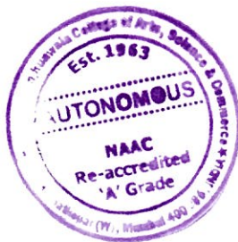
PRINCIPAL RAMNIRANJAN JHUNJHUNWALA COLLEGE OF ARTS, SCIENCE & COMMERCE (AUTONOMOUS) Ghatkopar (W), Mumbai 400086, Maharashtra, INDIA