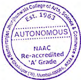
PRINCIPAL RAMNIRANJAN JHUNJHUNWALA COLLEGE OF ARTS, SCIENCE & COMMERCE (AUTONOMOUS) Ghatkopar (W), Mumbai-400 086, Maharashtra, INDIA