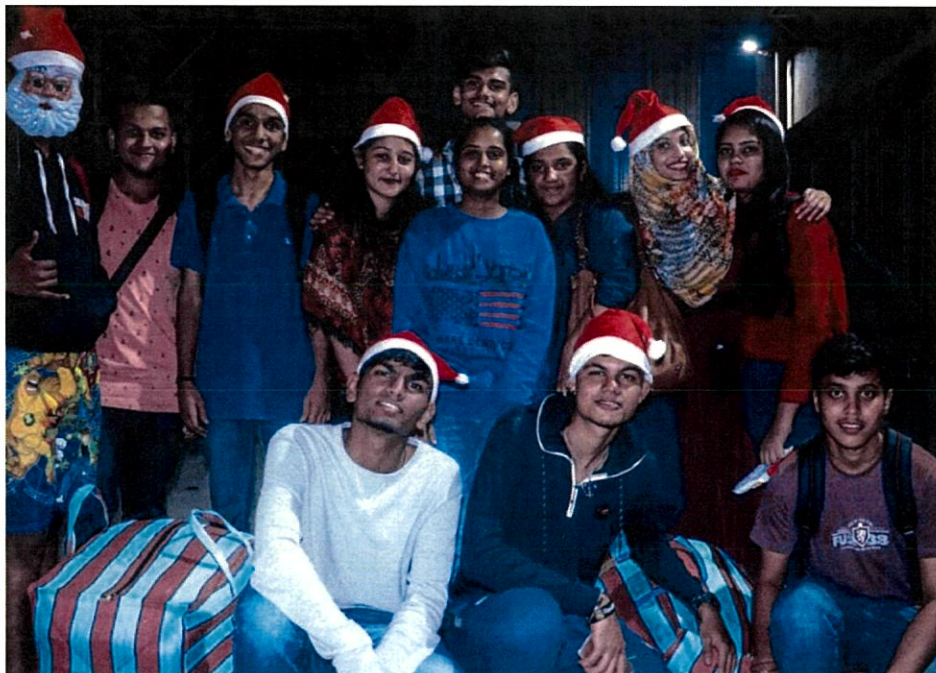
Students with blankets and toys ready to be distributed