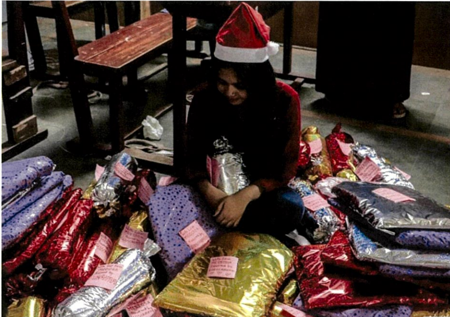
Our Department Student packing the gifts to be distributed