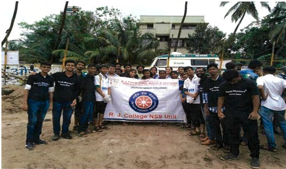
PHOTO OF STUDENT VOLUNTEERS DURING THE BEACH CLEAN-UP DRIVE HELD ON 21 ST JULY 2019

Affiliated to UNIVERSITY OF MUMBAI || NAAC Re-Accredited 'A' Grade (CGPA: 3.50)