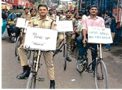
घाटकोपर : क्षयरोग जनजागृती रॅलीत सहभागी झालेले विद्यार्थी.