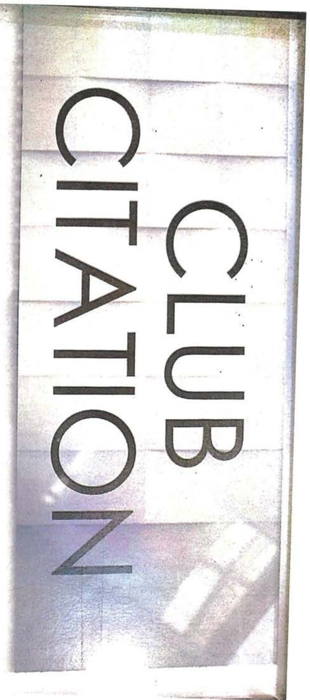
Rtr. Kushal Bhuva District Rotaract Representative 2019-20