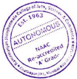
PRINCIPAL RAMNIRANJAN JHUNJHUNWALA COLLEGE OF ARTS, SCIENCE & COMMERCE (AUTONOMOUS) Ghatkopar (W), Mumbai-400 086, Maharashtra, INDIA

The link for the meeting will be shared on Whatsapp group.