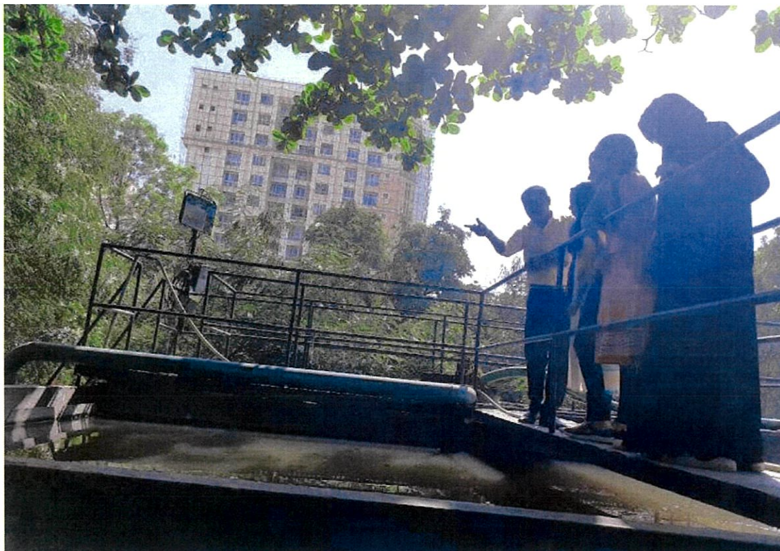
TYBT students visited Sewage Treatment Plant, Thane on 30th Jan 2020