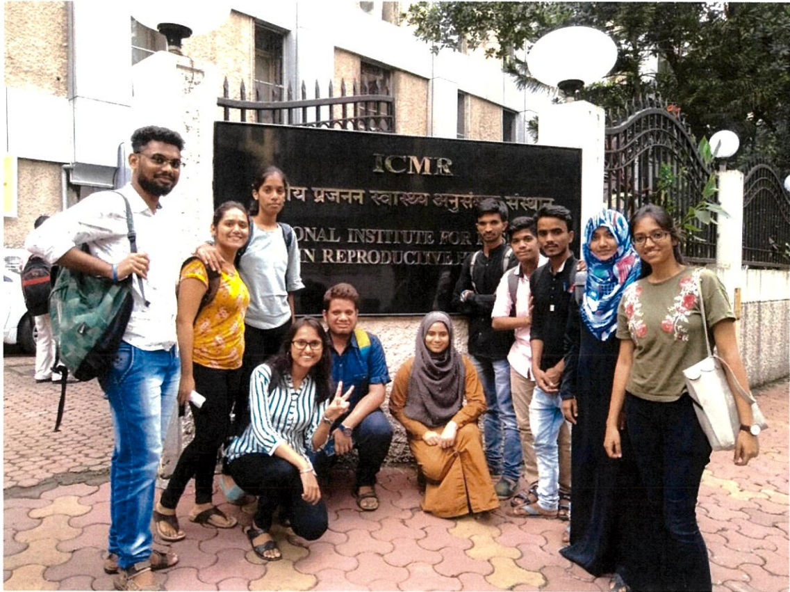
TYBT students (Department of Biotechnology, 2018-19) at NIRRH, Parel on 28th September 2018, on the occasion of Open day.

Affiliated to UNIVERSITY OF MUMBAI || NAAC Re-Accredited 'A' Grade (CGPA: 3.50)