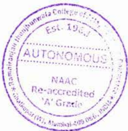
PRINCIPAL RAMNIRANJAN JHUNJHUNWALA COLLEGE OF ARTS, SCIENCE & COMMERCE (AUTONOMOUS) Ghatkopar (W), Mumbai-400 086, Maharashtra, INDIA