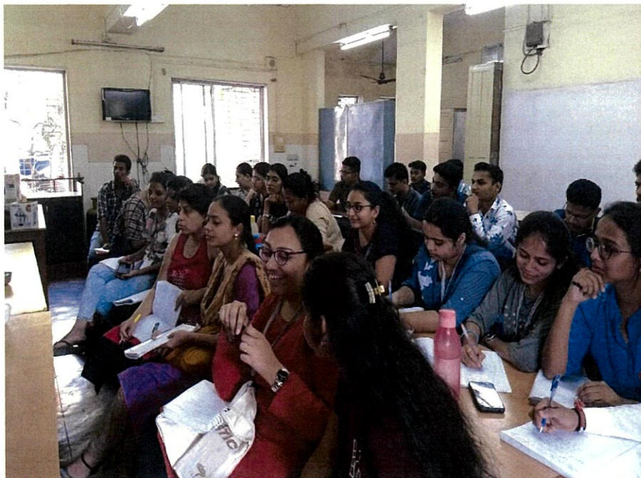
Students during the practical session