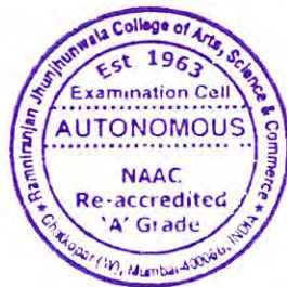
PRINCIPAL RAMNIRANJAN JHUNJHUNWALA COLLEGE OF ARTS, SCIENCE & COMMERCE (AUTONOMOUS) Ghatkopar (W), Mumbai-400 086, Maharashtra, INDIA