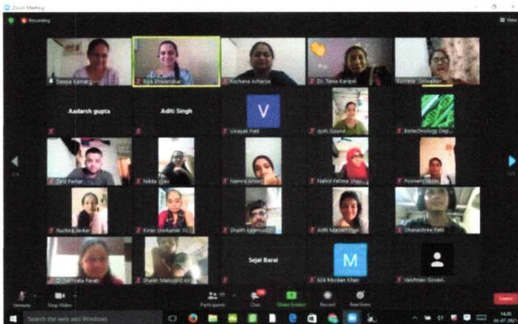
Pic 3: Screenshot of Valedictory interactive session with participants on 3rd July 2021 of value added course –“Fermented Food and Beverages” organised by Department of Biotechnology from 21st June to 5th July 2021.

Affiliated to UNIVERSITY OF MUMBAI || NAAC Re-Accredited 'A' Grade (CGPA: 3.50)