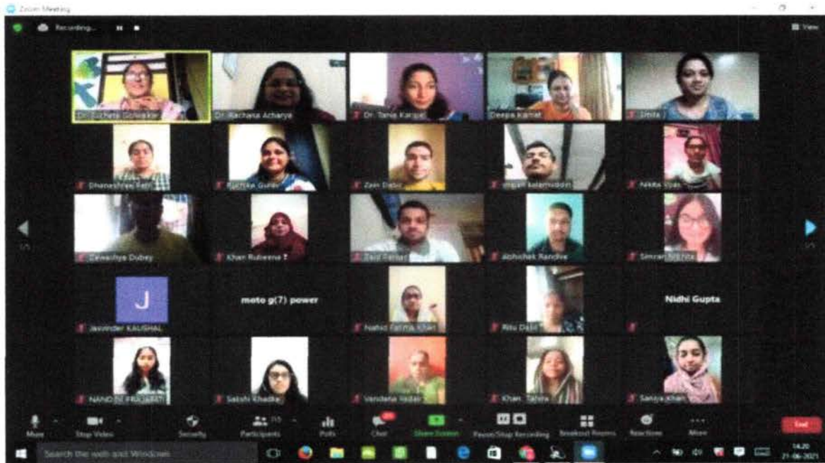
Pic 1: Screenshot of inaugural session on 21st June 2021 of Value added course –“Fermented Food and Beverages” organised by Department of Biotechnology from 21st June to 5th July 2021.

Affiliated to UNIVERSITY OF MUMBAI || NAAC Re-Accredited 'A' Grade (CGPA: 3.50)