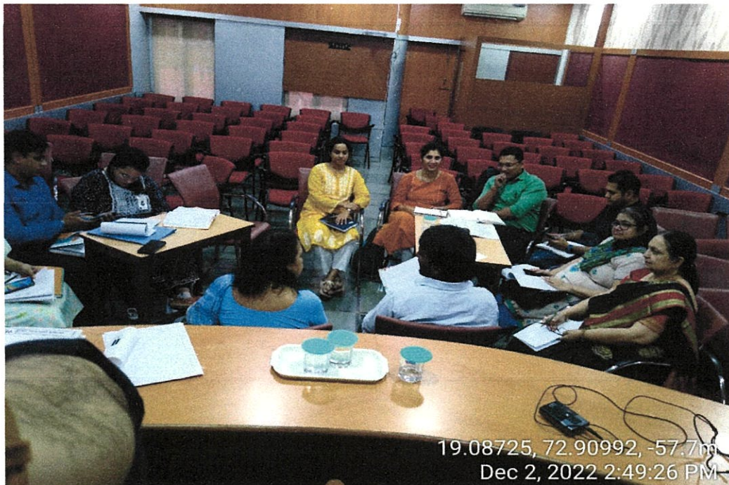
Members during sharing of useful inputs regarding Qualitative Matrix.