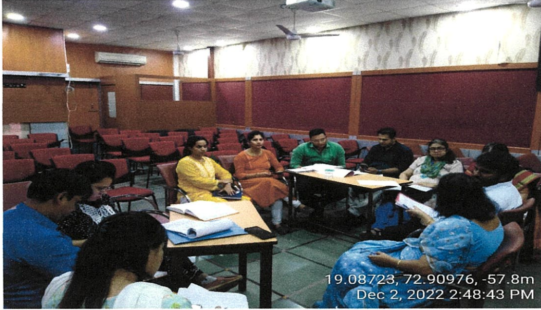
Members of Mentee colleges engrossed during the workshop