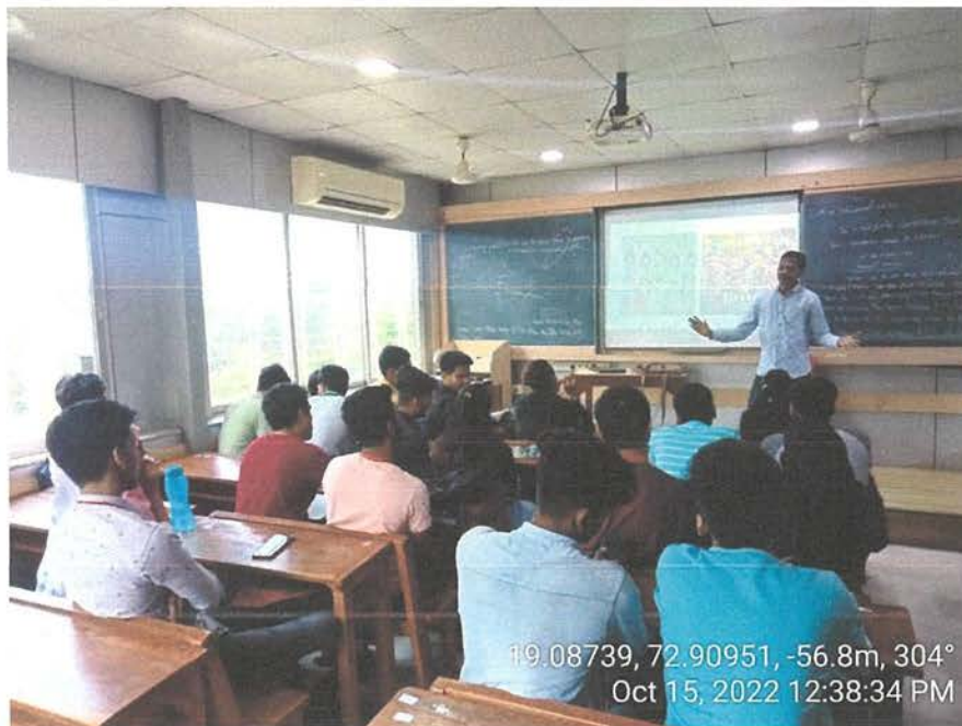
Students of BVoc during the session