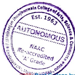
PRINCIPAL RAMNIRANJAN JHUNJHUNWALA COLLEGE OF ARTS, SCIENCE & COMMERCE (AUTONOMOUS) Ghatkopar (W), Mumbai-400 086, Maharashtra, INDIA