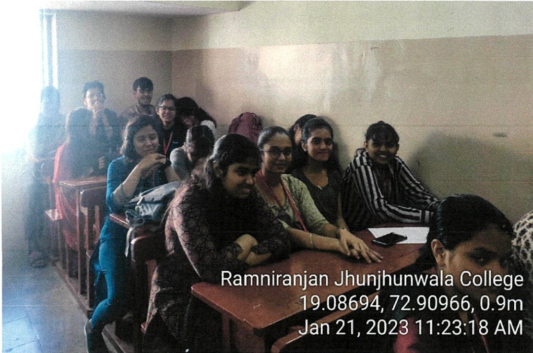
Ramniranjan Jhunjhunwala College 19.08694, 72.90966, 0.9m Jan 21, 2023 11:23:18 AM