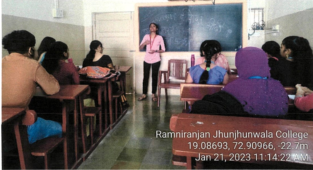
Ramniranjan Jhunjhunwala College 19.08693, 72.90966, -22.7m Jan 21, 2023 11:14:22 AM