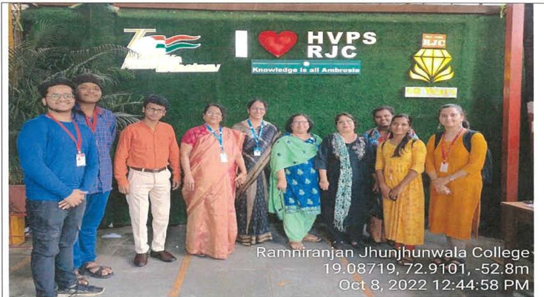
Ramniranjan Jhunjunwala College 19.08719, 72.9101, -52.8m Oct 8, 2022 12:44:58 PM