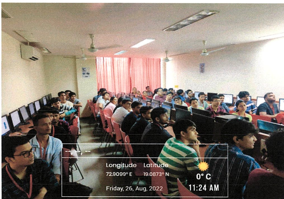
Students during the session