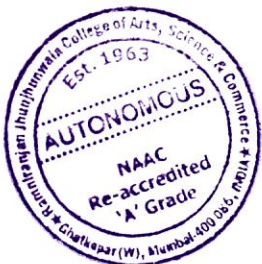
PRINCIPAL RAMNIRANJAN JHUNJHUNWALA COLLEGE OF ARTS, SCIENCE & COMMERCE (AUTONOMOUS) Ghatkopar (W), Mumbai-400086, Maharashtra, INDIA

Brief Description of the event: The event was all about Kitchen Gardening And which types of plants can be used to grow if one is planning to have kitchen garden. Different ways to take care of that plants was also be taught. Overall the event was amazing.