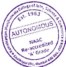
PRINCIPAL RAMNIRANJAN JHUNJHUNWALA COLLEGE OF ARTS, SCIENCE & COMMERCE (AUTONOMOUS) Ghatkopar (W), Mumbai-400 086, Maharashtra, INDIA

Overall, participants were satisfied with the event and they learned new knowledge on cyber security.