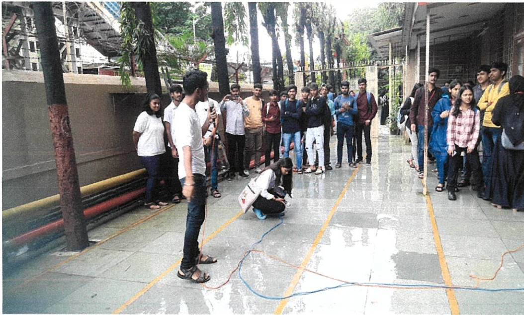
Students enacting a skit