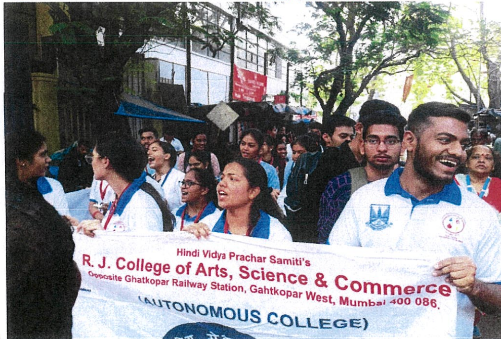
Students during the rally