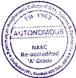
PRINCIPAL RAMNIRANJAN JHUNJHUNWALA COLLEGE OF ARTS, SCIENCE & COMMERCE (AUTONOMOUS) Ghatkopar (W), Mumbai-400 086, Maharashtra, INDIA