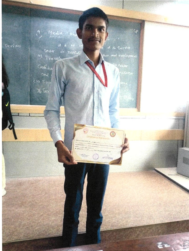
PHOTO OF THE WINNER OF QUIZ COMPETITION