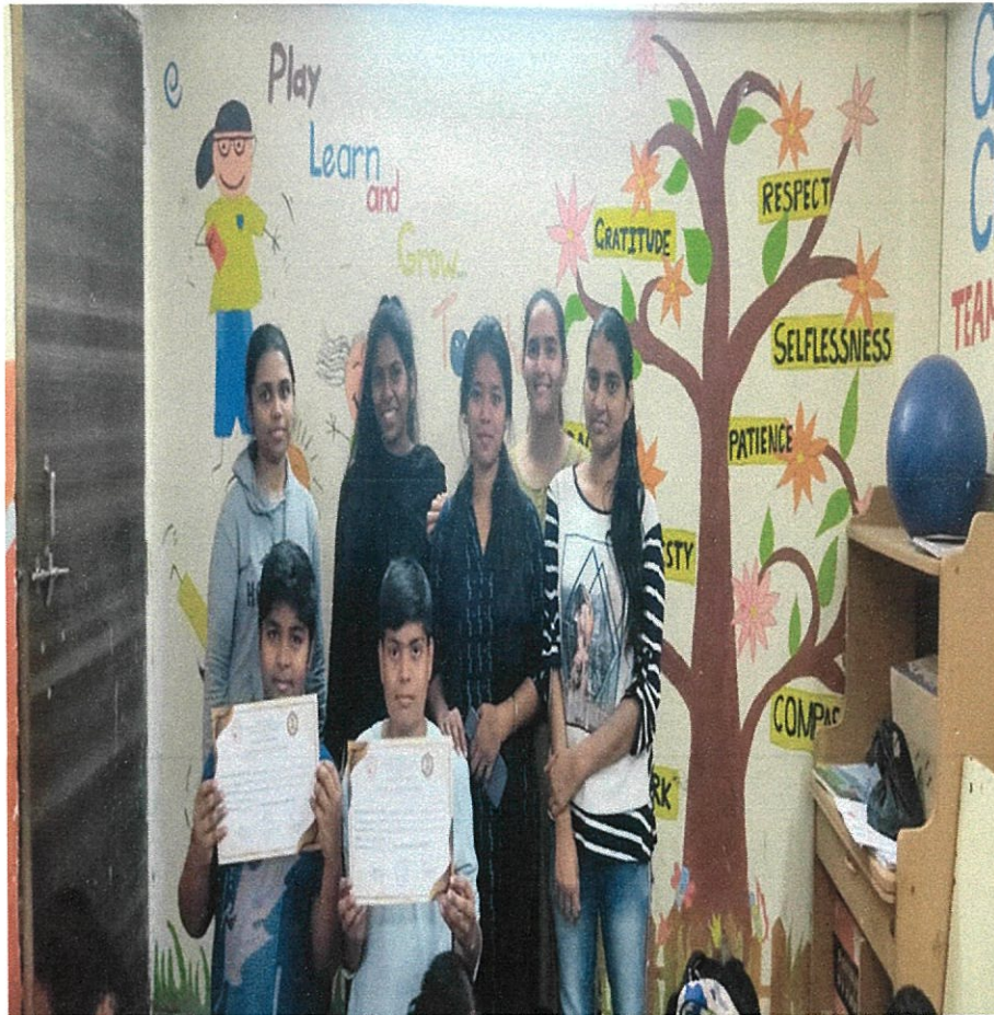
PHOTO OF THE WINNERS OF HANDWRITING COMPETITION