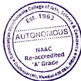
PRINCIPAL RAMNIRANJAN JHUNJHUNWALA COLLEGE OF ARTS, SCIENCE & COMMERCE (AUTONOMOUS) Ghatkopar (W), Mumbai-400 086, Maharashtra, INDIA