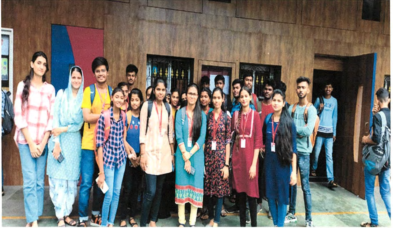
PHOTO OF THE WORLD PHOTOGRAPHY COMPETITION PARTICIPANTS

Affiliated to UNIVERSITY OF MUMBAI || NAAC Re-Accredited 'A' Grade (CGPA: 3.50)