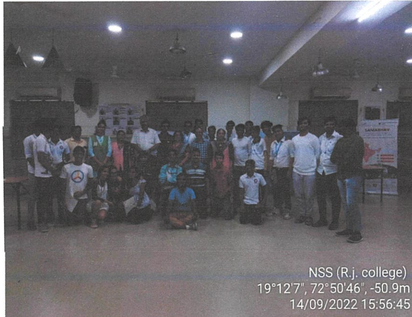
NSS (R.j. college) 19°12'7", 72°50'46", -50.9m 14/09/2022 15:56:45