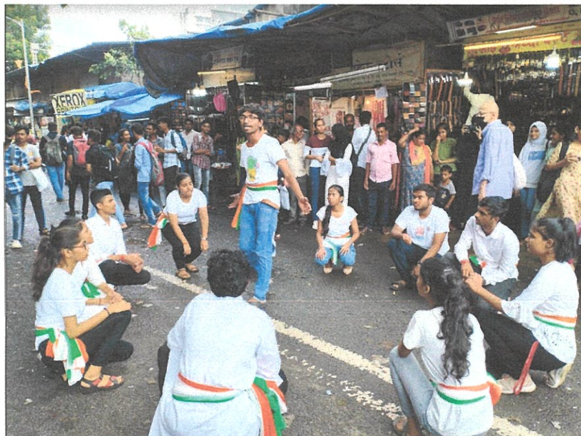
Students while performing the street play