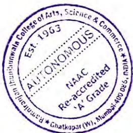
PRINCIPAL RAMNIRANJAN JHUNJHUNWALA COLLEGE OF ARTS, SCIENCE & COMMERCE (AUTONOMOUS) Ghatkopar (W), Mumbai-400 086, Maharashtra, INDIA

For the Year 2022-2023, from 08 th July 2022 to 26 th April 2023, the Safai Bank unit of R J College has deposited with the central depository about 61,481 MLPs with depositions made on 2 occasions on 04 th Jan. 2023 and 26 th Apr. 2023.