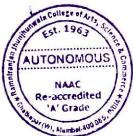
PRINCIPAL RAMNIRANJAN JHUNJHUNWALA COLLEGE OF ARTS, SCIENCE & COMMERCE (AUTONOMOUS) Ghatkopar (W), Mumbai-400 086, Maharashtra, INDIA