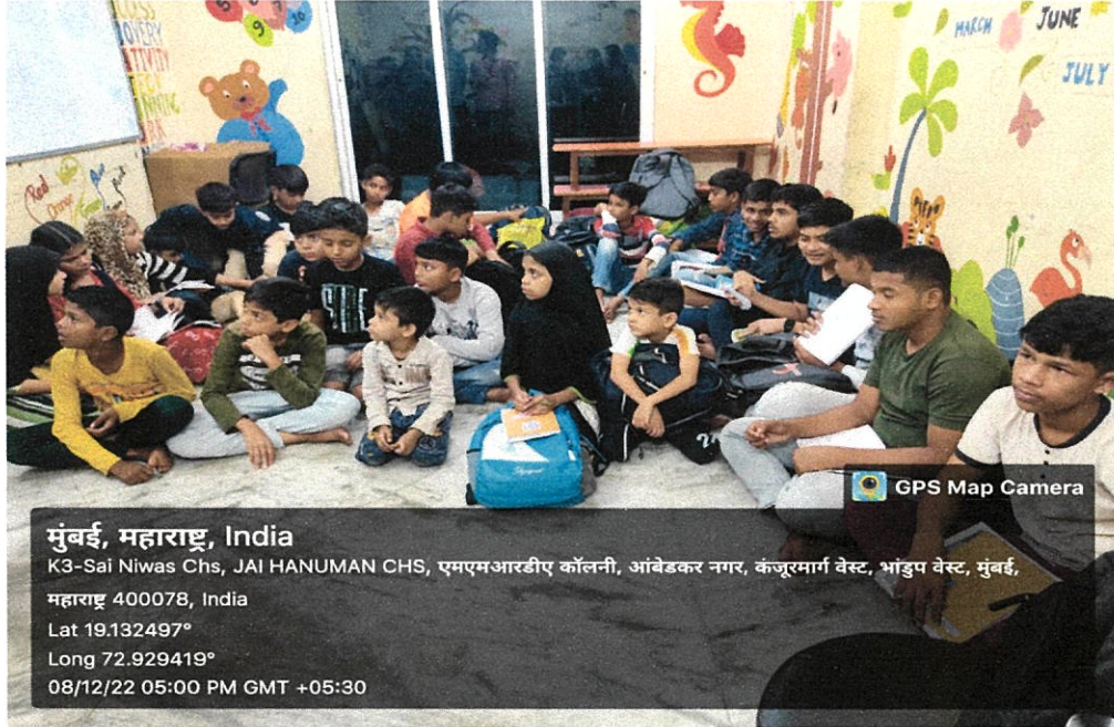
Volunteers are interacting with kids.

Photos of the Session held with Gully Class foundation for Pre-Primary kids held on 11 th October 2022