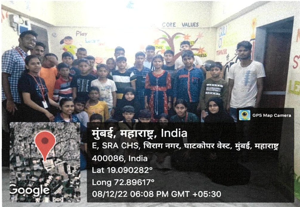
Group photo of volunteers with kids