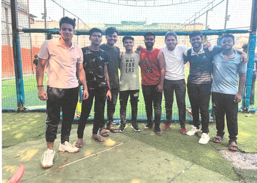
PHOTO OF STUDENT PARTICIPANTS OF SUNDAE CRICKET HELD ON 27/12/2022