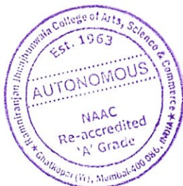
PRINCIPAL RAMNIRANJAN JHUNJHUNWALA COLLEGE OF ARTS, SCIENCE & COMMERCE (AUTONOMOUS) Ghatkopar (W), Mumbai-400 086, Maharashtra, INDIA