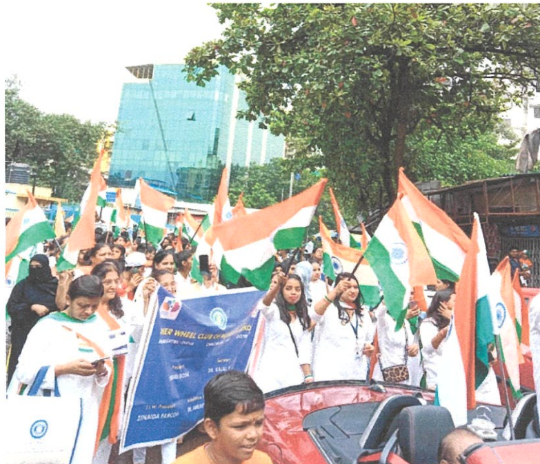
Students during the rally