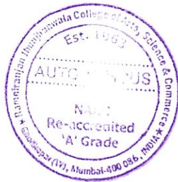
PRINCIPAL RAMNIRANJAN JHUNJHUNWALA COLLEGE OF ARTS, SCIENCE & COMMERCE (AUTONOMOUS) Ghatkopar (W), Mumbai-400 086, Maharashtra, INDIA

Overall, the experience was enjoyable for both the participants and the spectators alike.