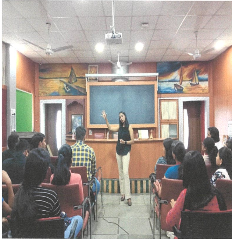
PHOTO OF THE SESSION ON GROUP DISCUSSION AND PERSONAL INTERVIEW

Affiliated to UNIVERSITY OF MUMBAI || NAAC Re-Accredited 'A' Grade (CGPA: 3.50)