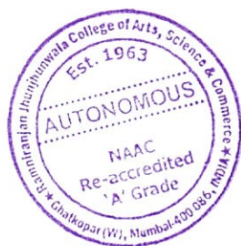
PRINCIPAL RAMNIRANJAN JHUNJHUNWALA COLLEGE OF ARTS, SCIENCE & COMMERCE (AUTONOMOUS) Ghatkopar (W), Mumbai-400 086, Maharashtra, INDIA

All the matches were top notch experience. Then the winners were announced and felicitated. With this the event on a good note.