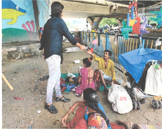
Students distributing food items to the needy