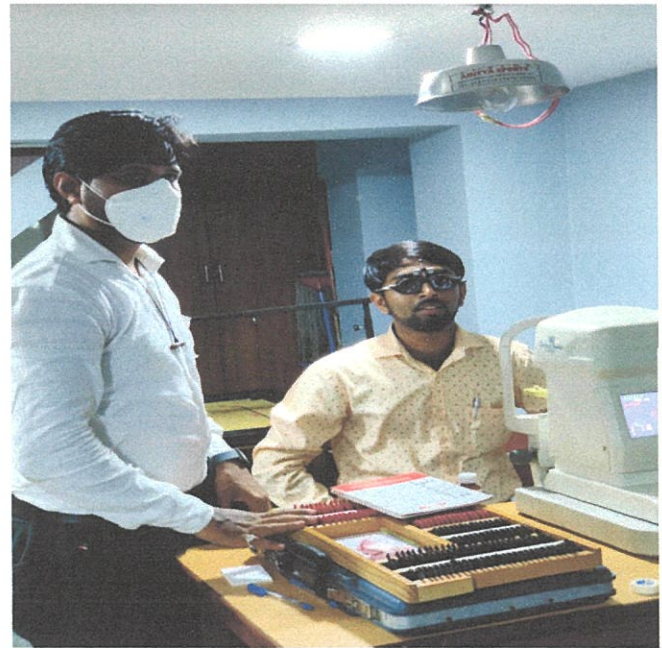
Students during the various events