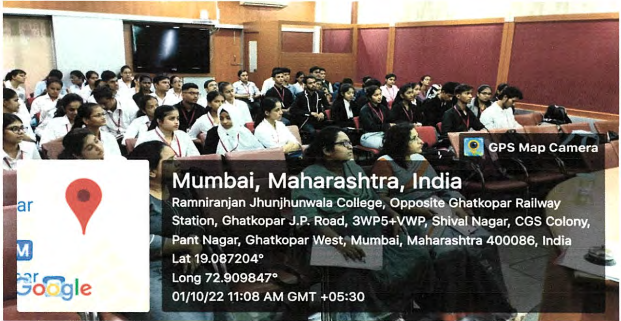
SYBT students in formals during “STRIKE-A-DEAL” -Entrepreneurial event

Affiliated to UNIVERSITY OF MUMBAI II NAAC Re-Accredited 'A' Grade (CGPA: 3.50)