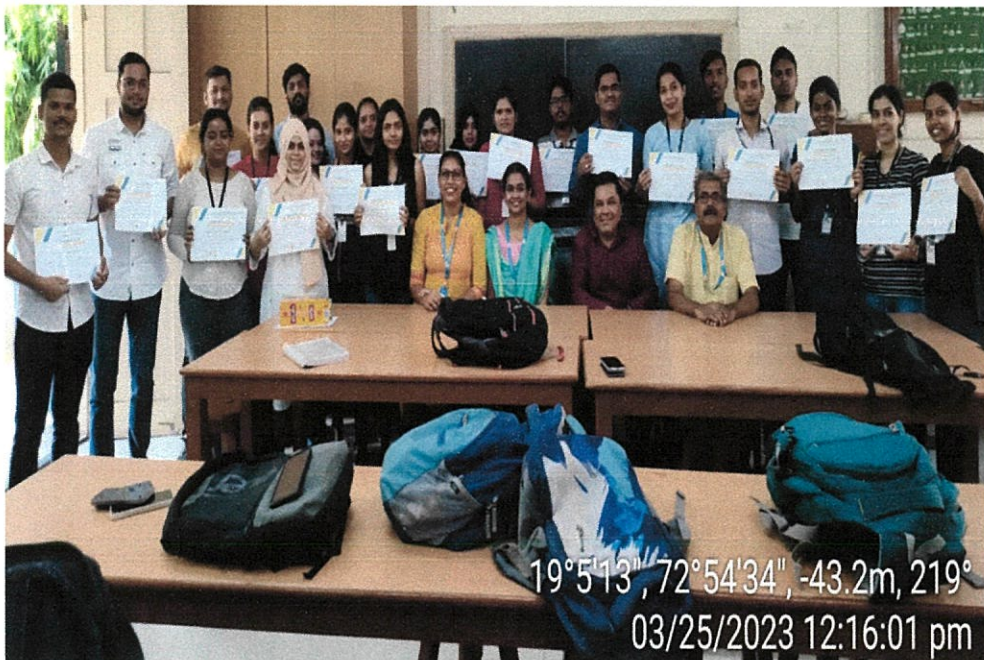
Students who completed the workshop successfully