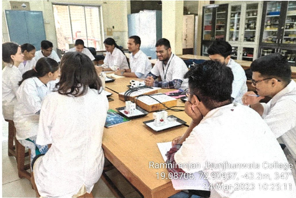
Students at their worktable during the workshop