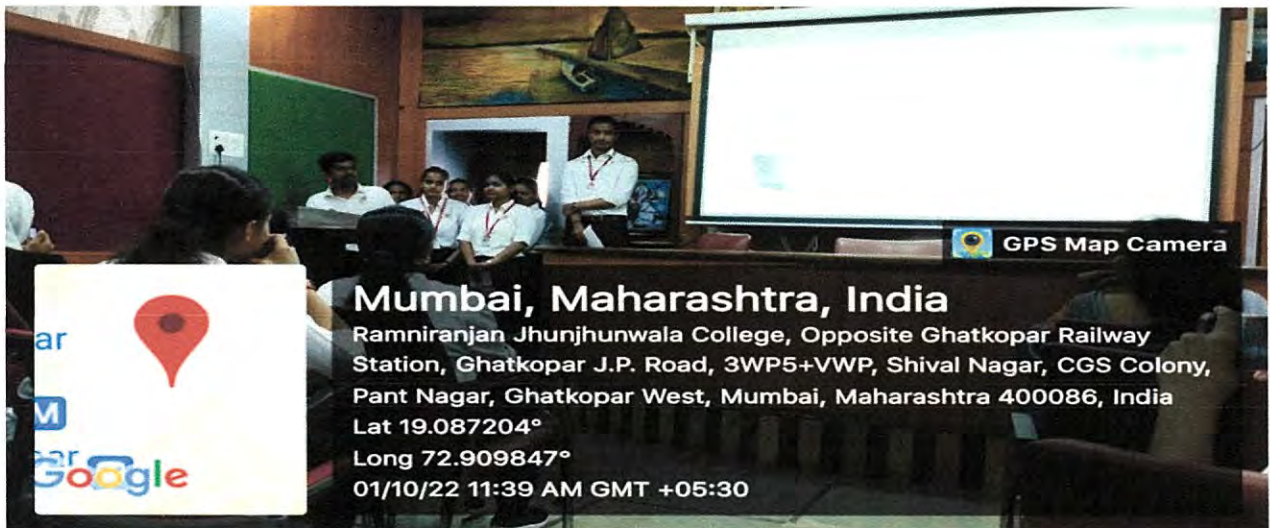
One of the groups proposing business idea during “STRIKE-A-DEAL” -Entrepreneurial event organized by the Biotechnology Department on 1st October 2022.