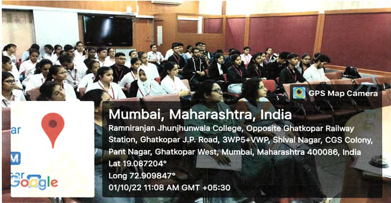
SYBT students in formals during “STRIKE-A-DEAL” -Entrepreneurial event

Affiliated to UNIVERSITY OF MUMBAI II NAAC Re-Accredited 'A' Grade (CGPA: 3.50)