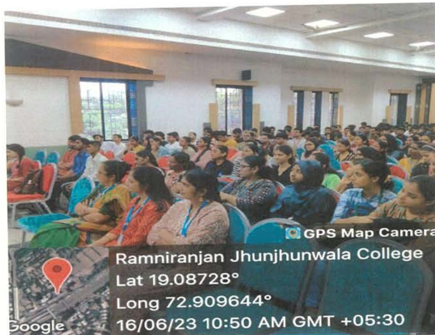
Students of SYBSc IT, CS, Biotech, SYBMS, SYBBI, SYBVOC, SYBAMMC and SYBAF during the Deeksharambh and Code of Conduct Session