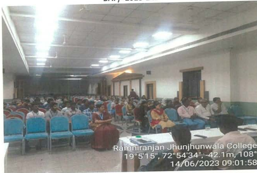
Students of SYBcom during the Deeksharambh and Code of Conduct Session

PHOTOGRAPHS OF DEEKSHARAMBH – STUDENT INDUCTION PROGRAM (SIP) FOR STUDENTS OF SYBA/BSc/BCom, TYBA/BSc/BCom, SY & TY Self Finance – (IT, CS, Biotech, BMS, BBI, BVOC, BAMMC, BAF) -2023-24.