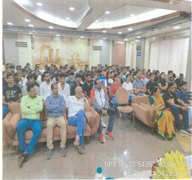
Audience during the Gymkhana Day celebration